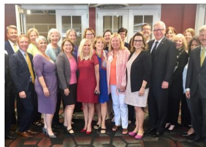
2019 Assisted Living License Bill Signing